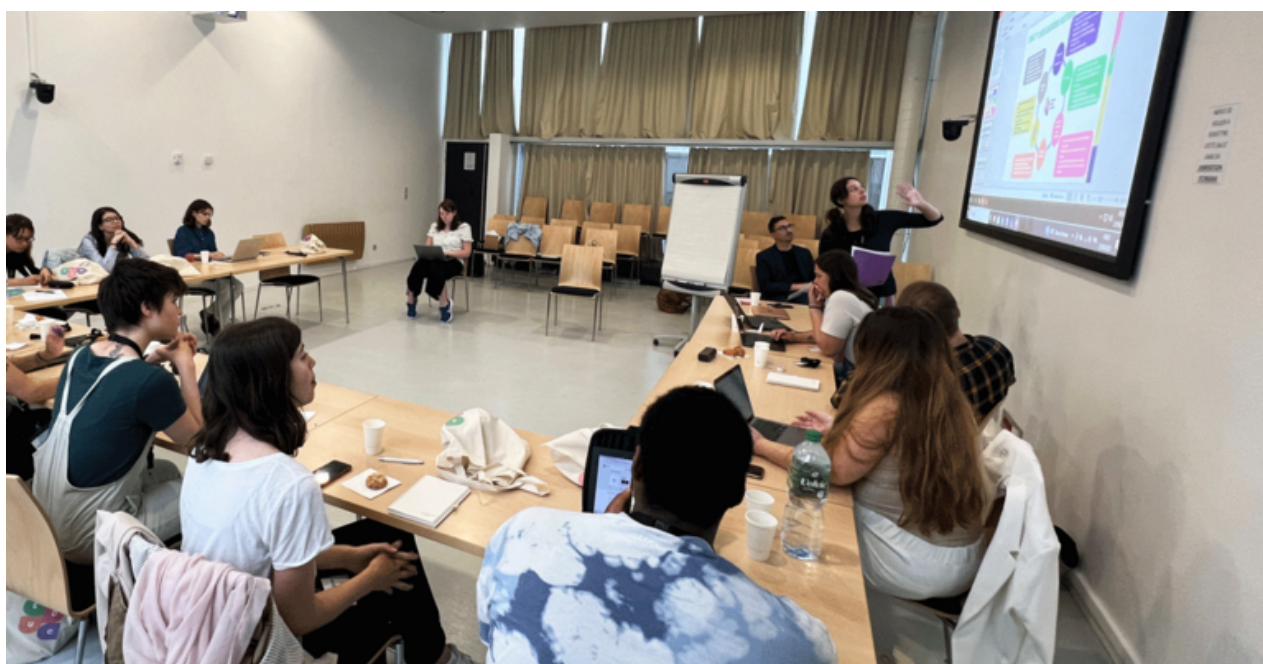
THINK TANK: The Student Board gathered at University Paris-Nanterre June 2023.

With this structure we also make sure that our board members are able to extend the sweet spot between interest and capacity for their own engagement.